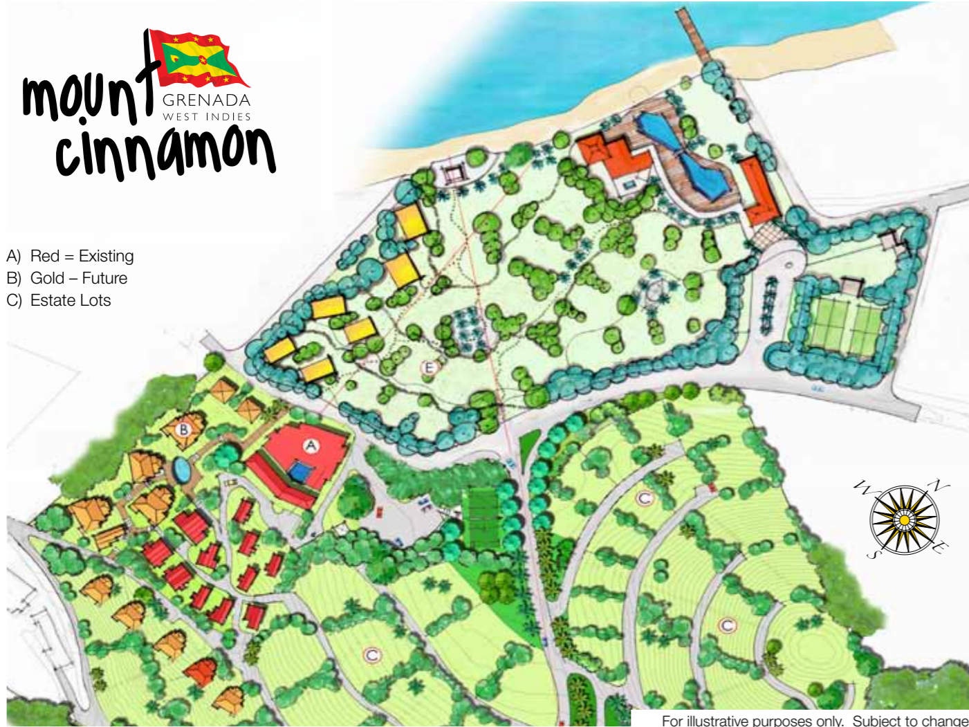
For illustrative purposes only. Subject to change.